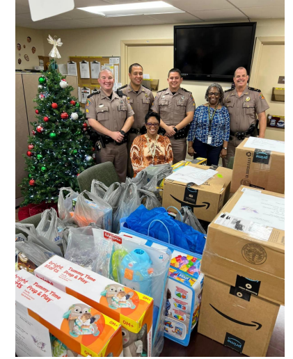
As always, the community came through for this year's gift drive. Here is a picture of the Florida Highway Patrol, which provided gifts to 15 children in foster care.

Communities Connected for Kids is a community-based lead agency contracted by the Florida Department of Children and Families.